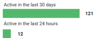
Accounts with EyeOnWater