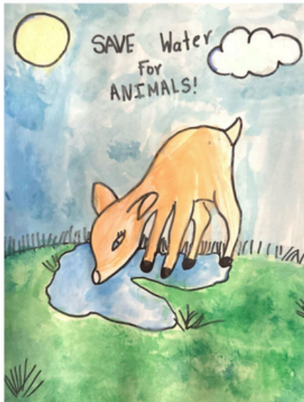
1 ST PLACE PIPER S. PARK CITY DAY SCHOOL